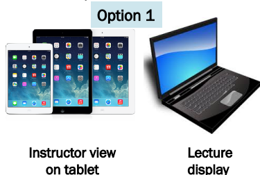
Instructor view on tablet

login to the LC instructor account/deliver questions on the tablet or smartphone. Project your lecture content on your laptop or classroom computer connected to the projector.