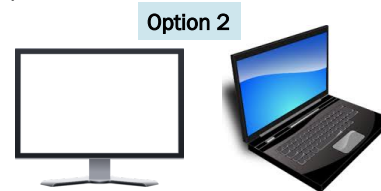
Instructor view on classroom computer

login to the LC instructor account/deliver questions on the classroom computer. Project your lecture content on your personal laptop.